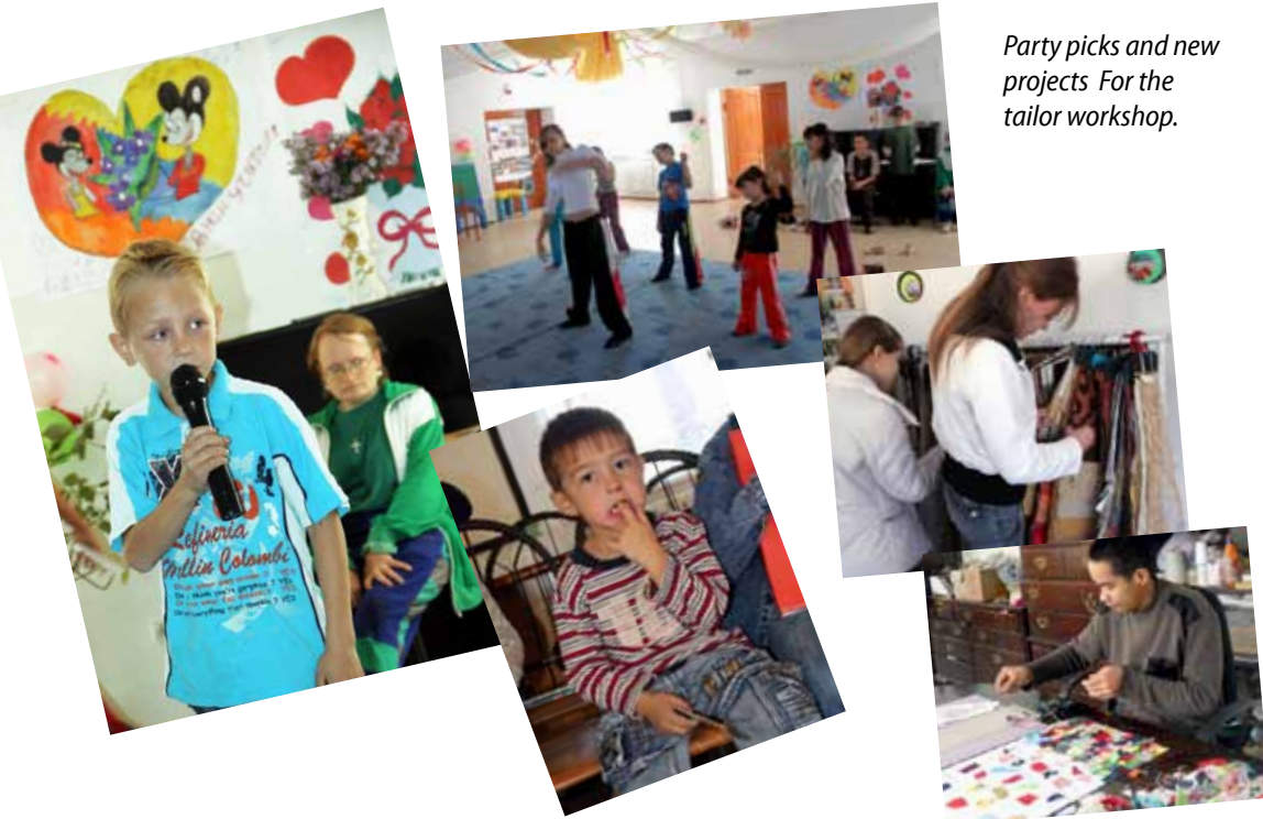
Party picks and new projects For the tailor workshop.