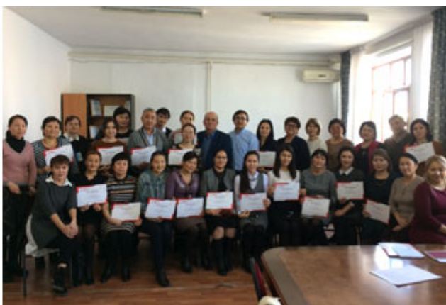
Meeting future parents and foster parents outside the Ark Village

Our carpentry workshop is always busy but sometimes we need its help for special projects, like repairing the closets in the Village. Over the past few months, with the help of outside friends, all closets in the kids' rooms have been repaired and renewed.