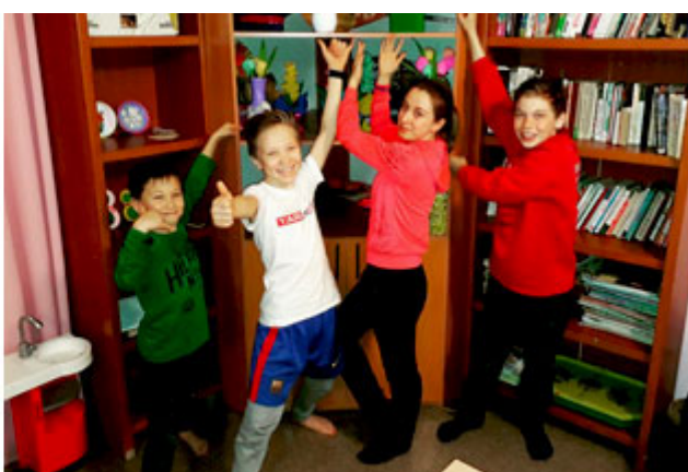
Happiness is: a new closet for clothes and books and toys and...

Air Astana staff regularly visit us. Each visit, a different department of the airline supports a project, paying attention