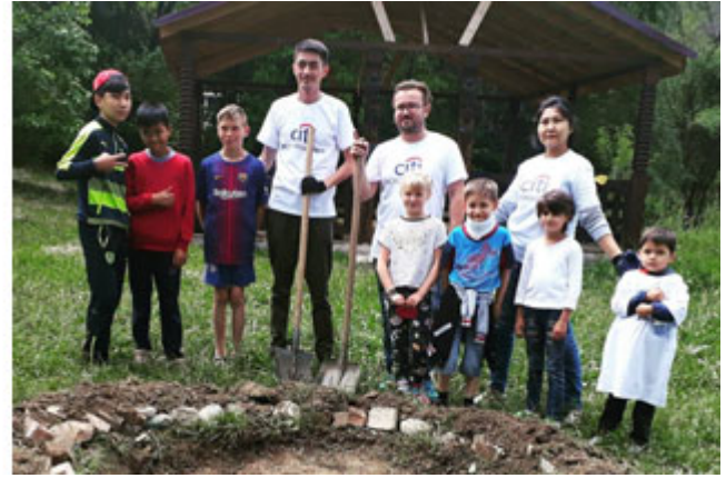
The 'green' day with Citibank and...