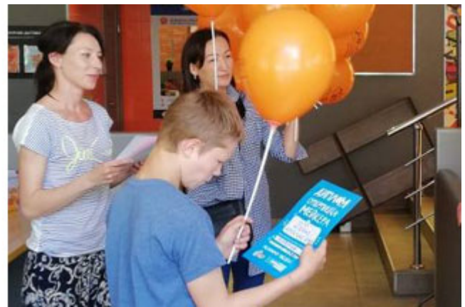
we are all pizza chefs with Dodo pizza!