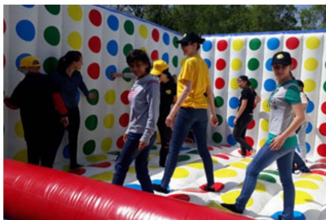
A colorful day with Beeline